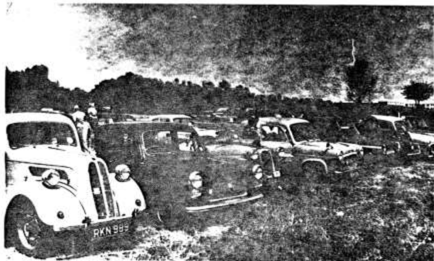
SIDEVALVE DAY. 11th JULY 1976